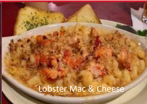
Lobster Mac & Cheese