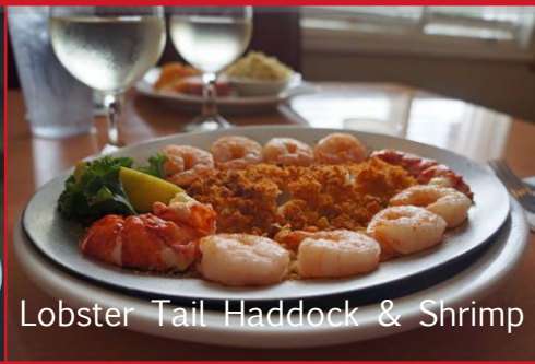
Lobster Tail Haddock & Shrimp